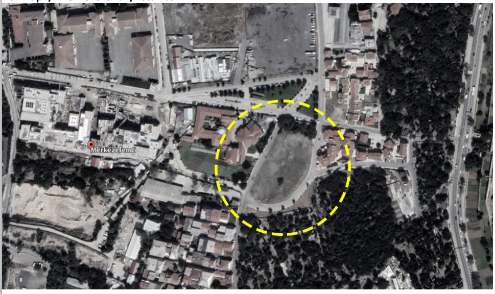
Spaces of/for Learning. - Site 2