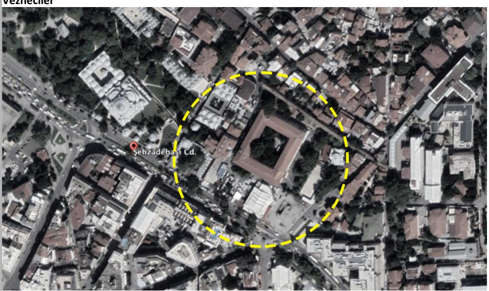
The site and design topic for ARCH 401 Spaces of Performing Arts - Halic - Site 1

Spaces of Performing Arts - Haliç - Site 1 The sites nearby Eyüp Evlendirme Dairesi and Miniatürk will be analyzed and selected by each student.